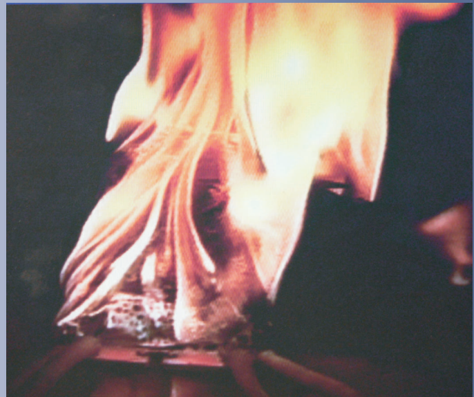
Fire caused by an overcharged battery

The BaSyTec Battery Safety Device (BSD) is an optional extension of the BaSyTec Battery Test Systems. It will independently monitor all critical parameters of the battery and its ambient and will switch off the battery current by locking the main output relay if any parameter exceeds its safe range.