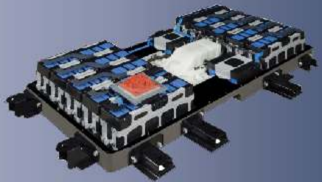
Car Battery-Pack of a Mitsubishi-i-electric car.

On the other hand tens or even hundreds of signal inputs must be configured and the large amount of stored data must be handled. Sophisticated software tools are necessary to make this work simple and to avoid mistakes in configuration and data handling.