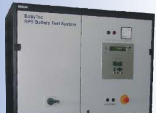
RPS Battery Test System

The RPS system is optimized for high power and high energy automotive systems, like HEV, PHEV, EV and SLI batteries and dlc.